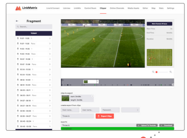
Upload or download clip